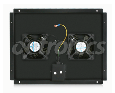
2 double fan kit, 120 VCA 60Hz